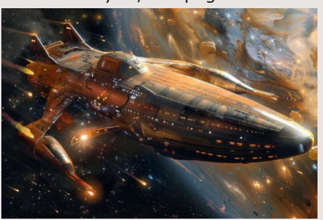
Solar Queen on her maiden voyage six years ago